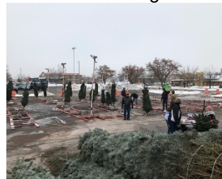
From early morning, left, to late Friday evening, as shown below.