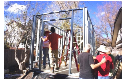
more can be seen by Clicking Here.