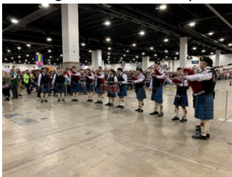
GABF Opening Ceremony

Then I was off to the San Jose area for business with great weather (as show by the rental car) then came back to the typical Mother Nature scenario of Denver. Pix say it all.