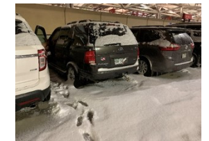
... then this upon my return