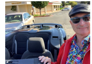
Nice weather Rental in California