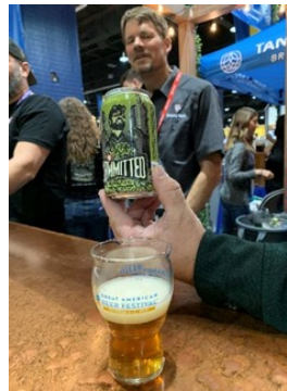
BJ's Original Brewer