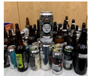
Tasting Table close-up