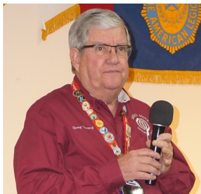
Greg Young Photo Noel Hasselgren

The Tree lot net was $9,000 over budget and a real bonus. The OI Annual