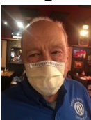
“I’m helping protect you!”