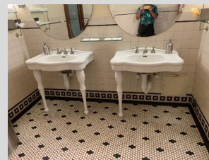
Above, one sink must be from Pirated of the Caribbean.