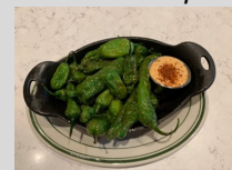
Left, a Dallas Sunrise at 7:15a.m. Above, Blistered Shishito Peppers, mild and tasty.