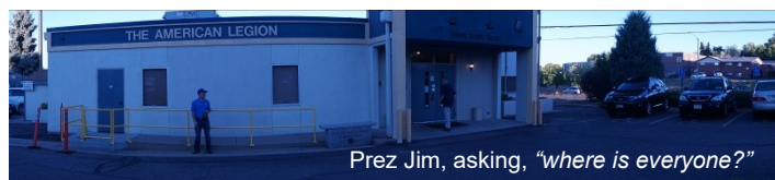
Prez Jim, asking, "where is everyone?"