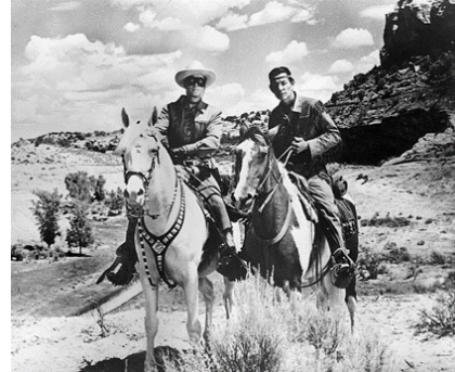
Clayton Moore, aka The Lone Ranger, and Jay Silverheels, aka Tonto in 1949.