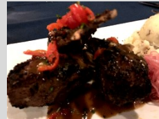
Lamb Chops, more like rack of Lamb

And for this week's travelogue ... not bad for Joplin, MO