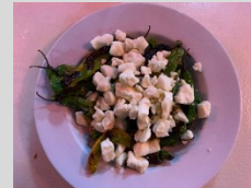
Blistered Shishito Peppers with curds