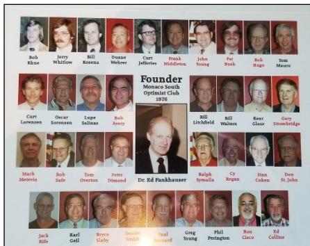
Above, Monaco South Club presidents recognized from 1976 to 2011, a total of 35 club leaders.