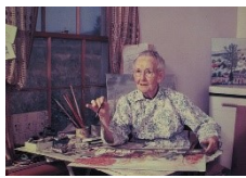
Happy Birthday to Anna Mary Robertson Moses, aka Grandma Moses.

Welcome to September 7! This day has been declared as National Beer Lovers Day. It has also been named by some, National Salami Day, National Feel the Love Day, National Acorn