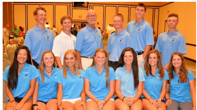
A number of the Colorado golfers come together for a group picture.