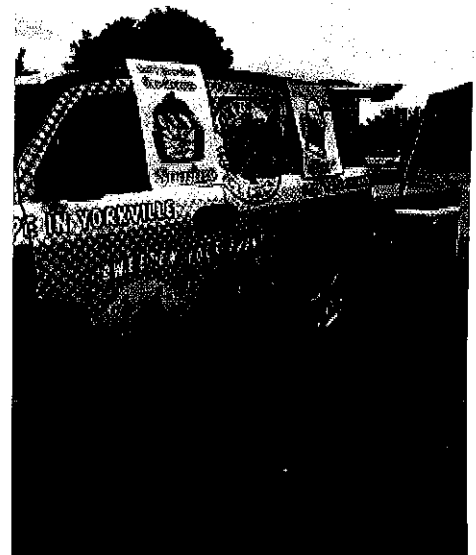
Foxy's Ice Cream From Yorkville