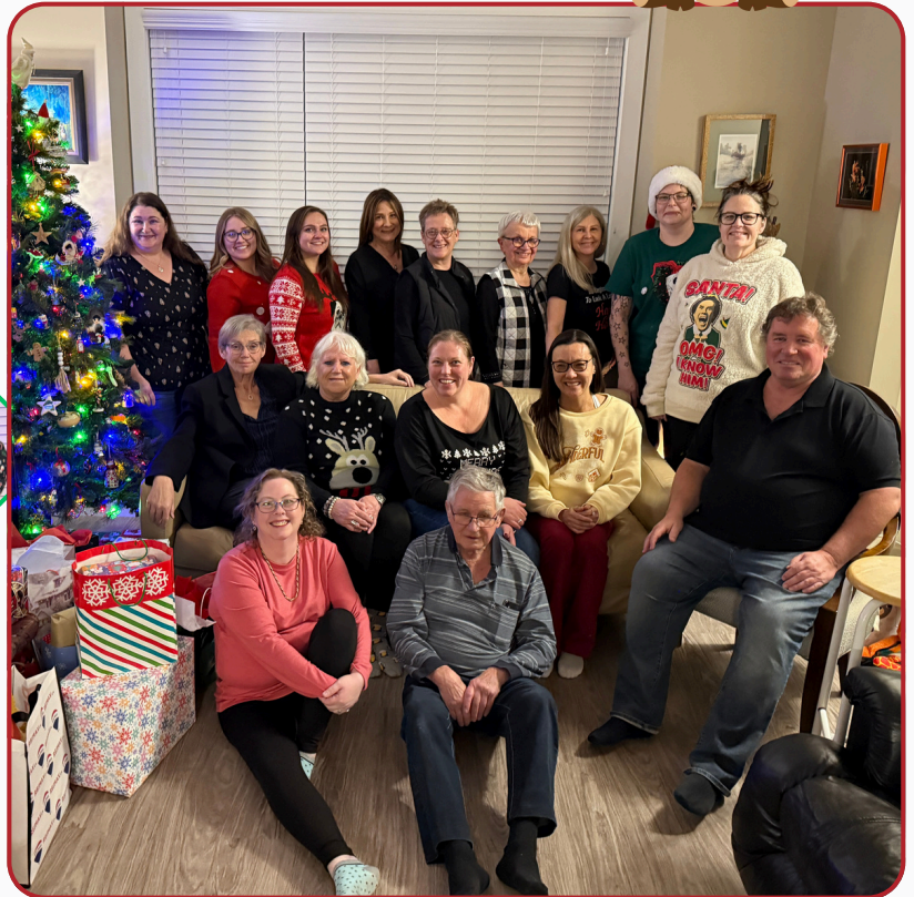
Merry Christmas and Happy New Year from the Edmonton Cosmos!