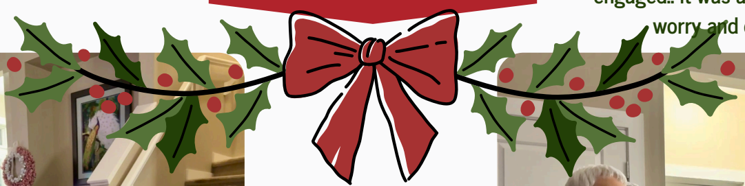
This year we let a die decide who gets what gift - lots of moving and uncertainty, it really kept us engaged.. it was a real mix of worry and excitement!