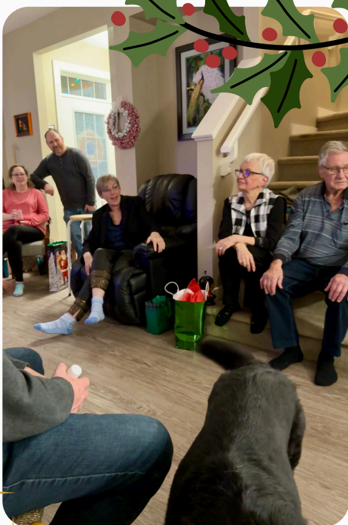
Sometimes we have to explain the gift a bit... like cowboy Santa or an accidentally feminine vase - one of the gifts that has circulated at more than one Cosmo Christmas