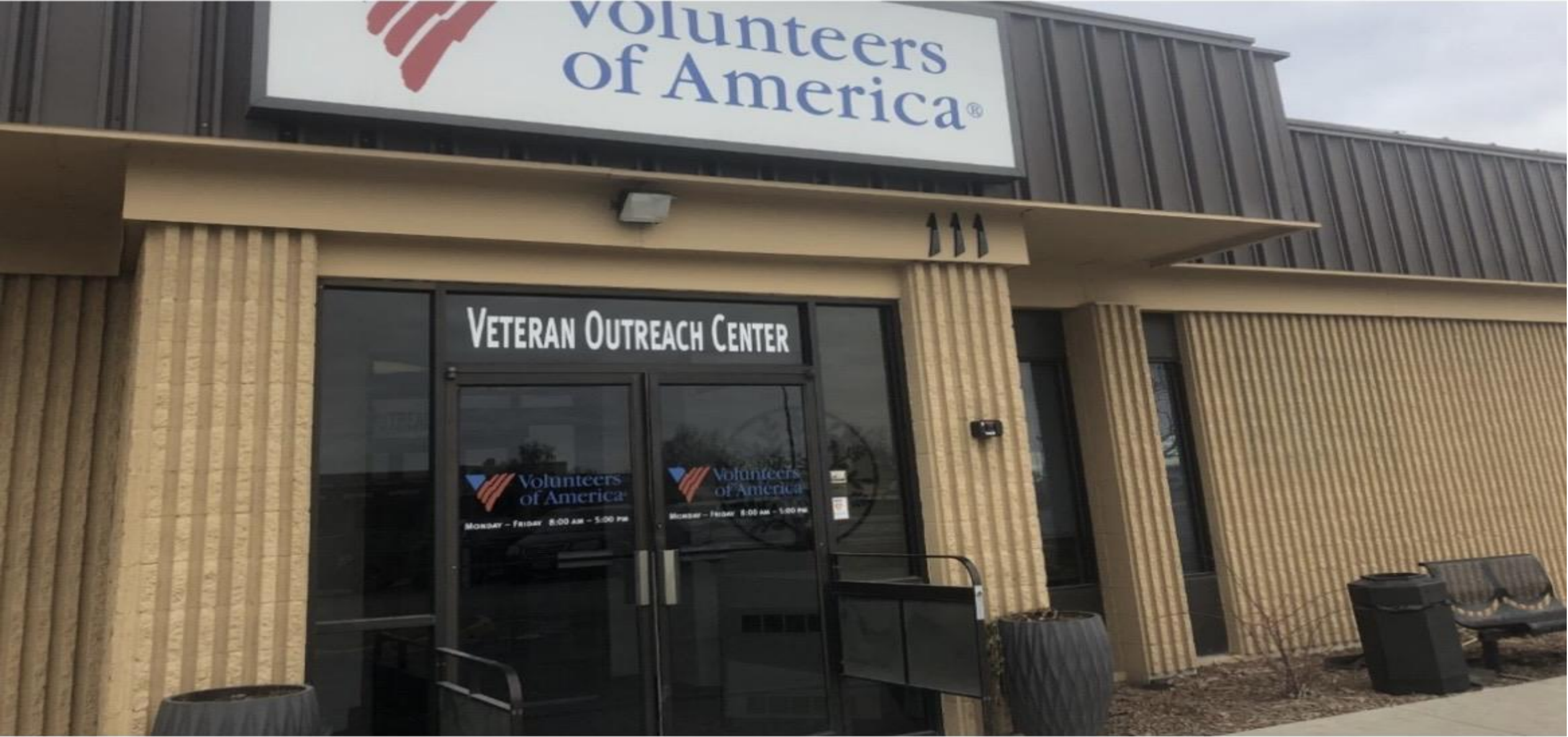
Volunteers of America Northern Rockies, Rapid City, S.D.