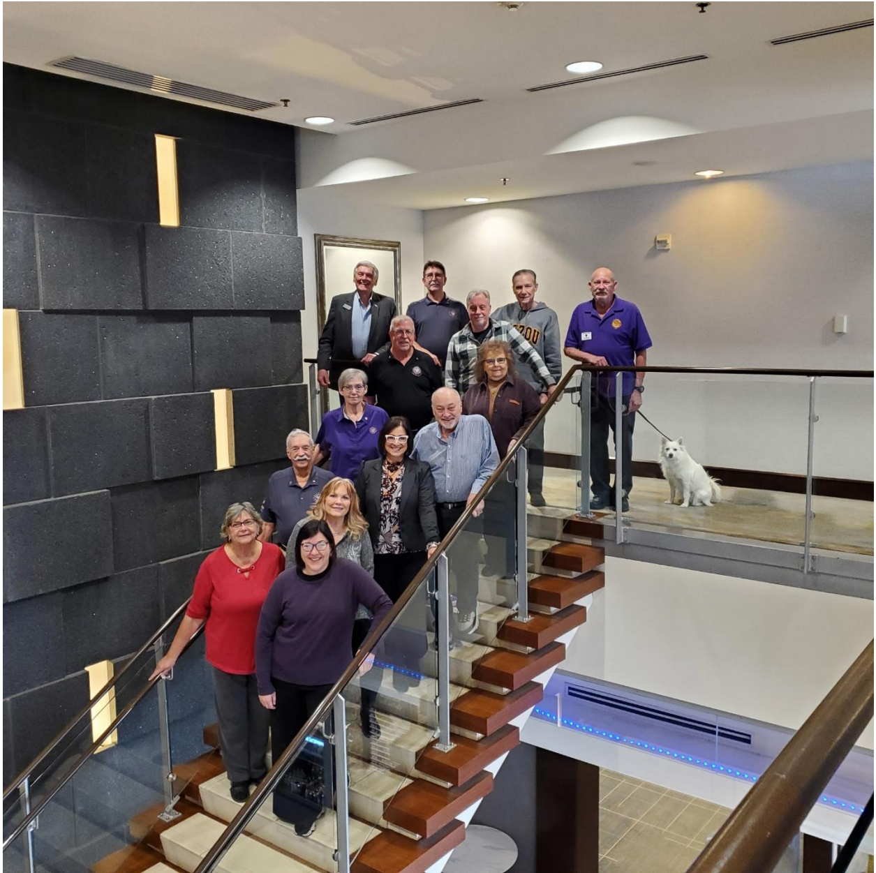
The Whole Crew!!