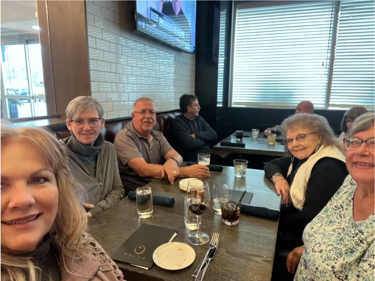
Having some social time and relaxing.