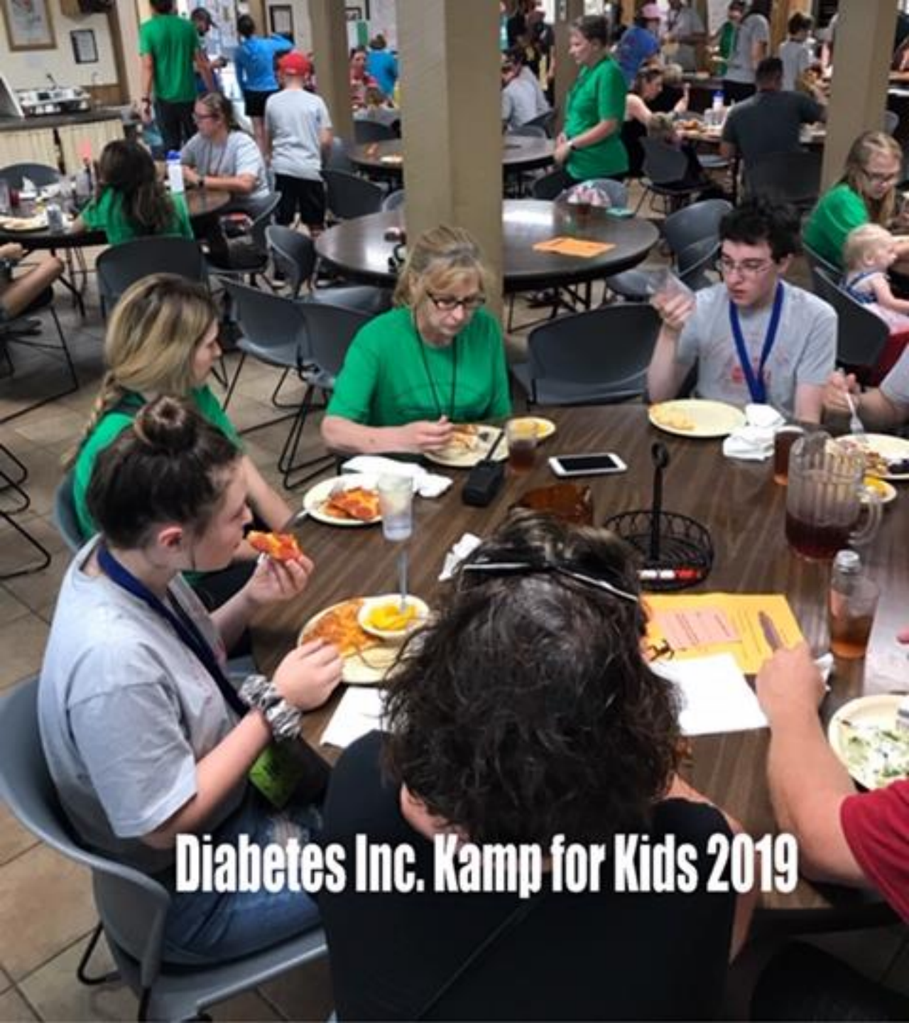
Diabetes Inc. Kamp for Kids 2019