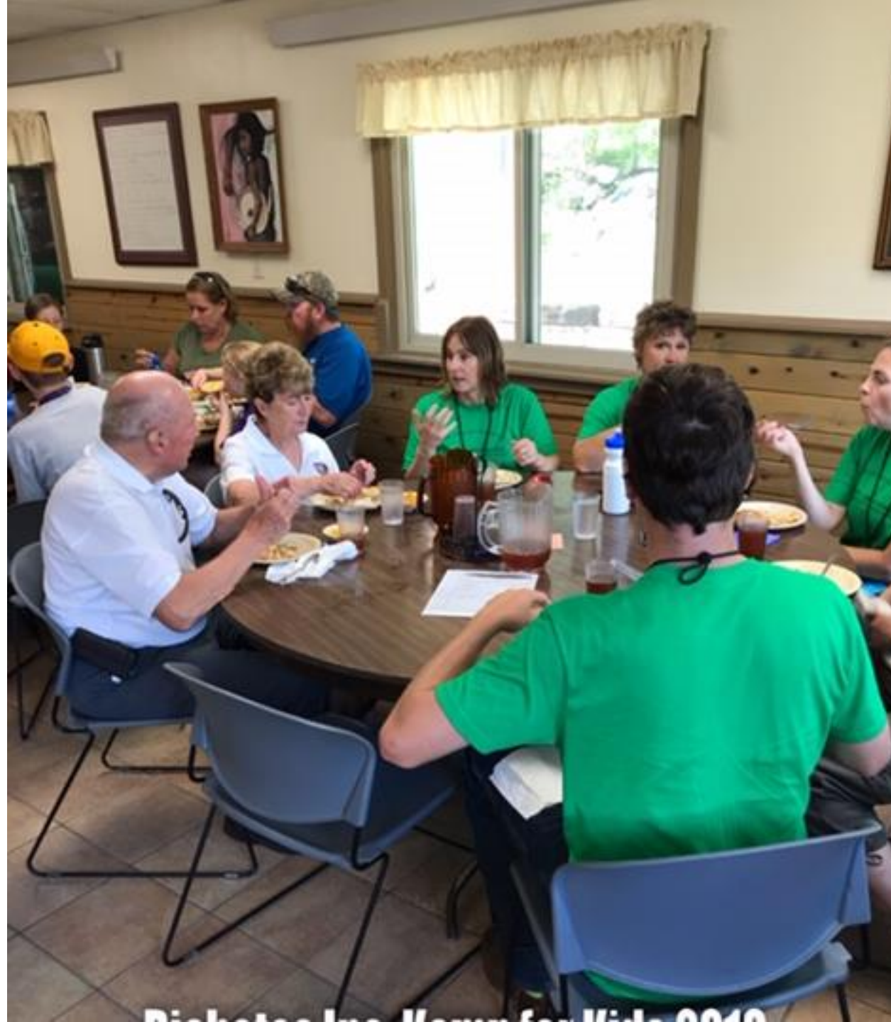
Diabetes Inc. Kamp for Kids 2019