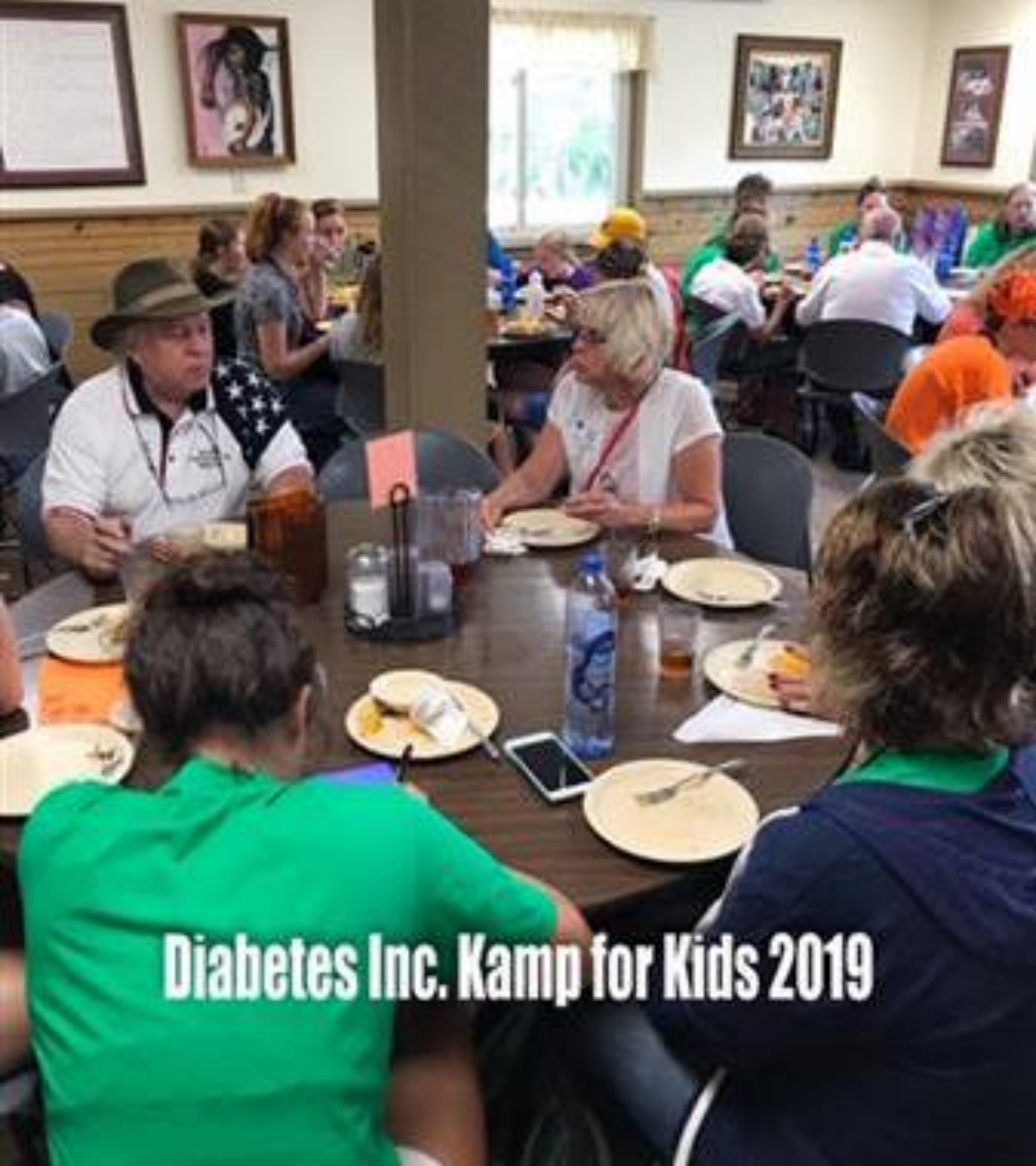
Diabetes Inc. Kamp for Kids 2019