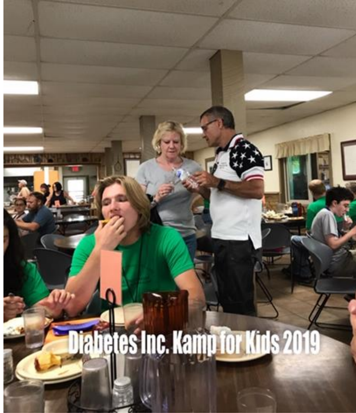
Diabetes Inc. Kamp for Kids 2019