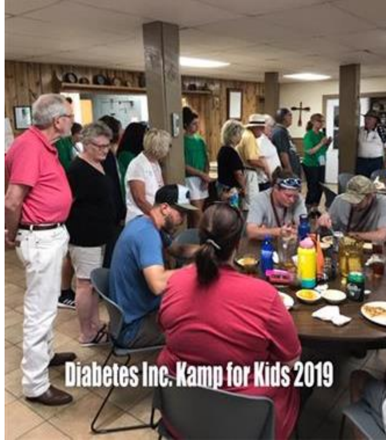
Diabetes Inc. Kamp for Kids 2019