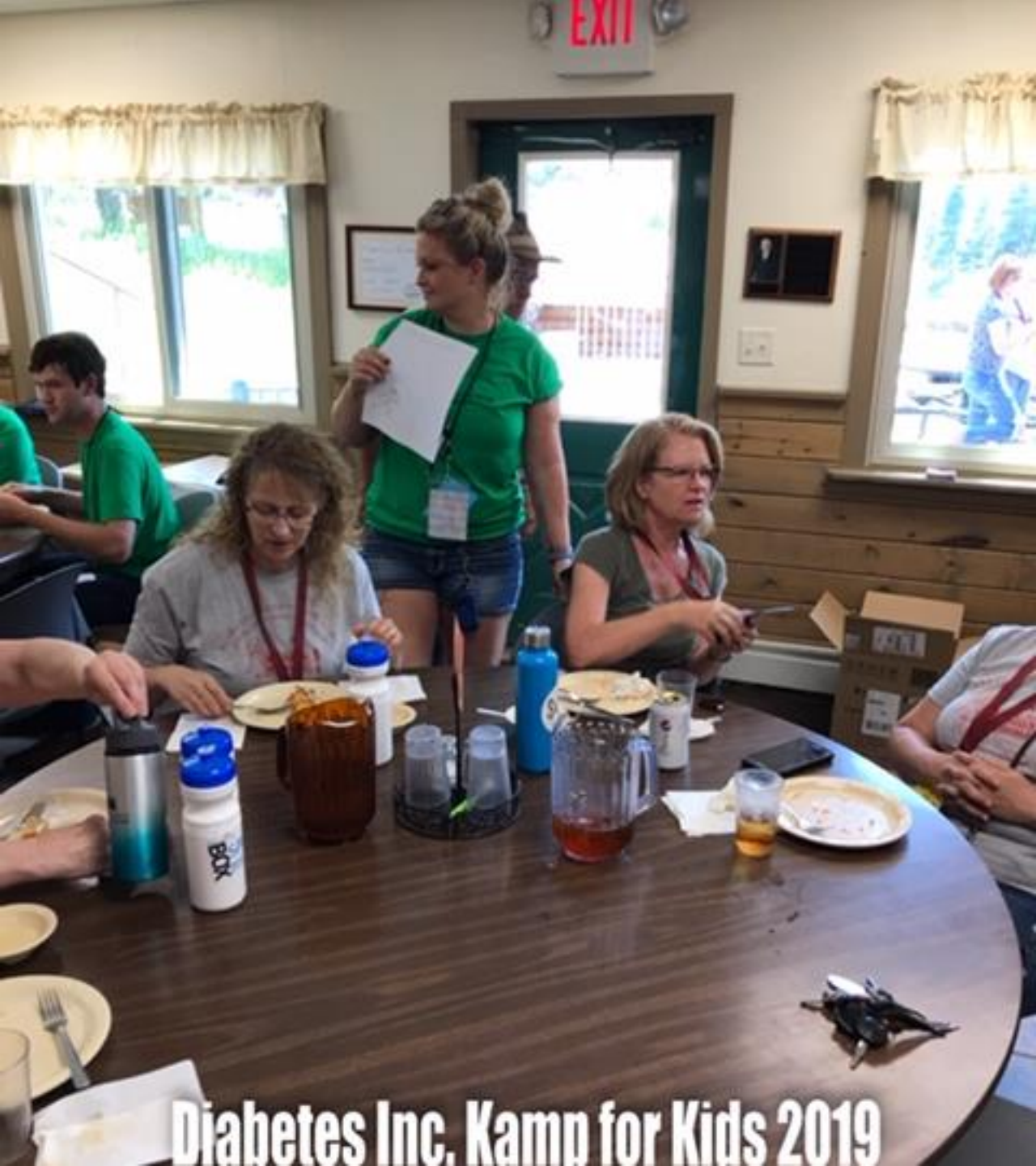
Diabetes Inc. Kamp for Kids 2019