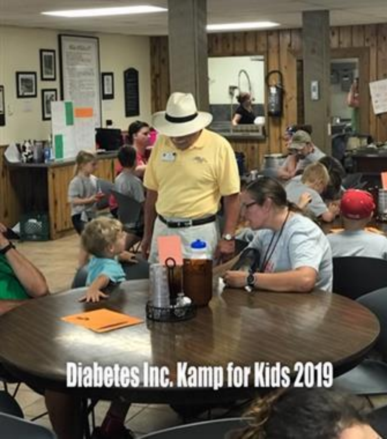
Diabetes Inc. Kamp for Kids 2019