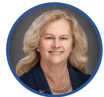
ARC/ICA Mindi Snyder