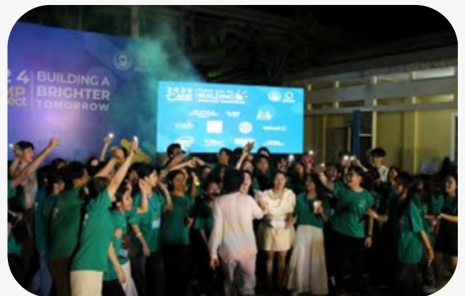
Bond Fire and Talent Show were highlights for many campers as they danced and sang together