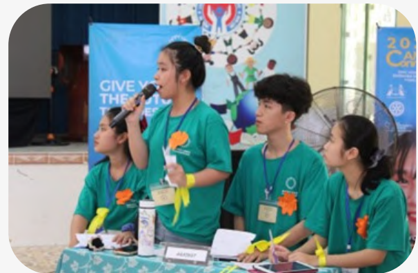
English Debate contestants provided thought-provoking arguments in their presentations