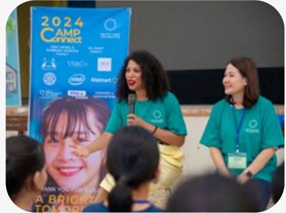
Campers attended life skills & career orientation workshops, topics included STEM, leadership, and trafficking prevention